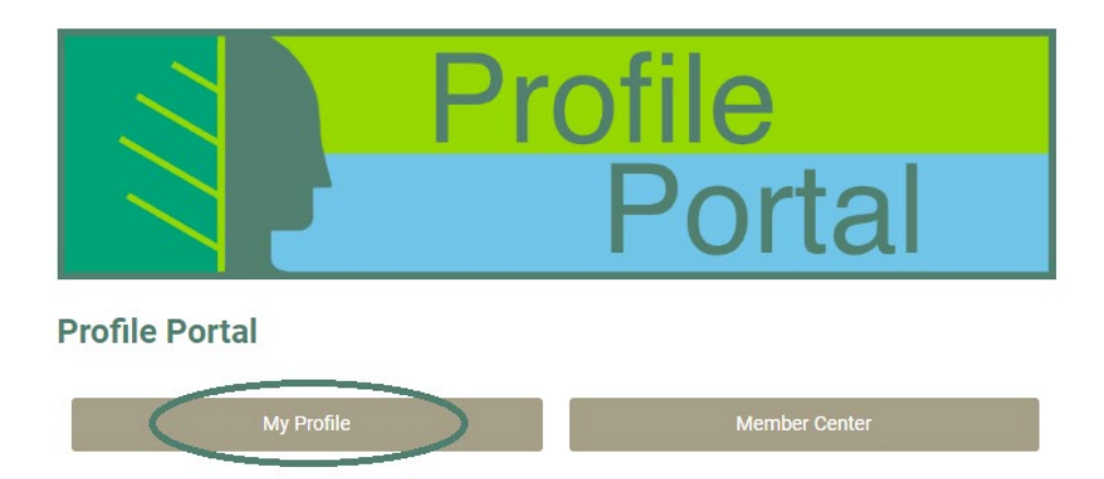
Step 1: Log into your profile and click the My Profile button.

Step 2: On your profile, hover over My Features in the top menu bar. Mouse down and click on E-lists.